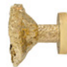
COMB EA1049 Door Knob