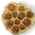
COMB EA1022 Drawer Handle