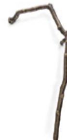
LIMB EA1056R/EA1056L Door Pull