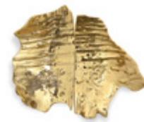
LEAF EA1053 Door Pull