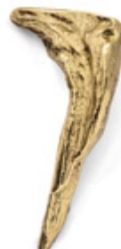
KERMA EA1029 Door Pull