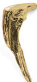
KERMA EA1028 Door Pull