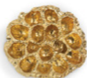
COMB EA1021 Cabinet Handle