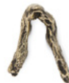
LIMB EA1027 Drawer Handle