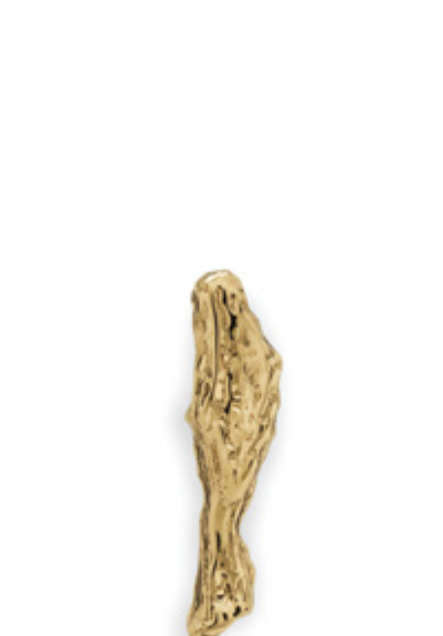
EA1005 H: 14 mm | 0,55" L: 91 mm | 3,58" D: 30 mm | 1,18" MATERIALS: Brass FINISHES: Polished Brass (Also Available in Aged & Brushed Brass) WEIGHT: 129 g / 0,28 Lbs FIXING SYSTEM: Screws M5