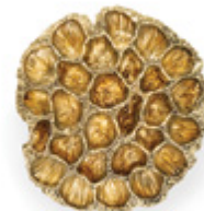
COMB EA1069 Cabinet Handle/Door Pull